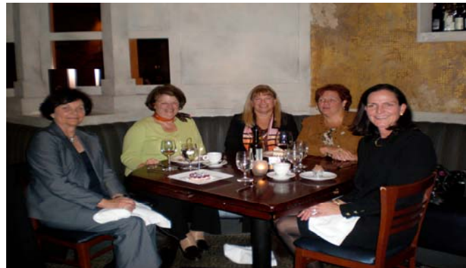
Alliance friends enjoying dinner